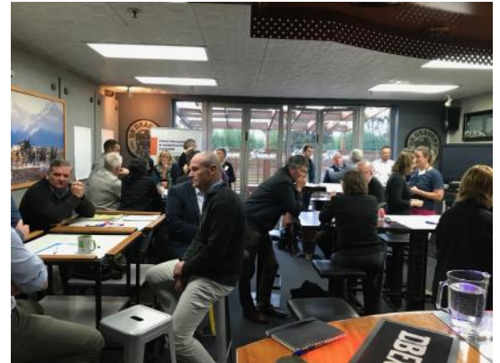
Participants at the inaugural Sustainable is Attainable Hui

The companies have some common waste materials, which can place considerable strain on the region's waste management facilities, particularly the landfill at Redruth. The repurposing and reusing of some of the waste materials produced in the region could be a significant step in the right direction to extend the life of the landfill and to gain more value from these wastes, and moving South Canterbury towards a circular economy.